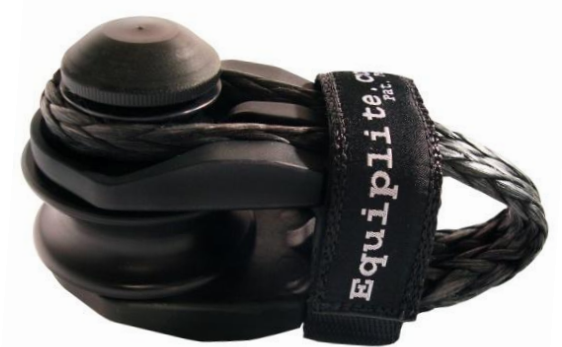
Low load version