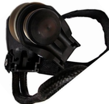
Full offering with quick loop

Our compact loop system and clean protection reduces damage to the yacht. Safer: Extremely light weight reduces risk of injury when flogging.